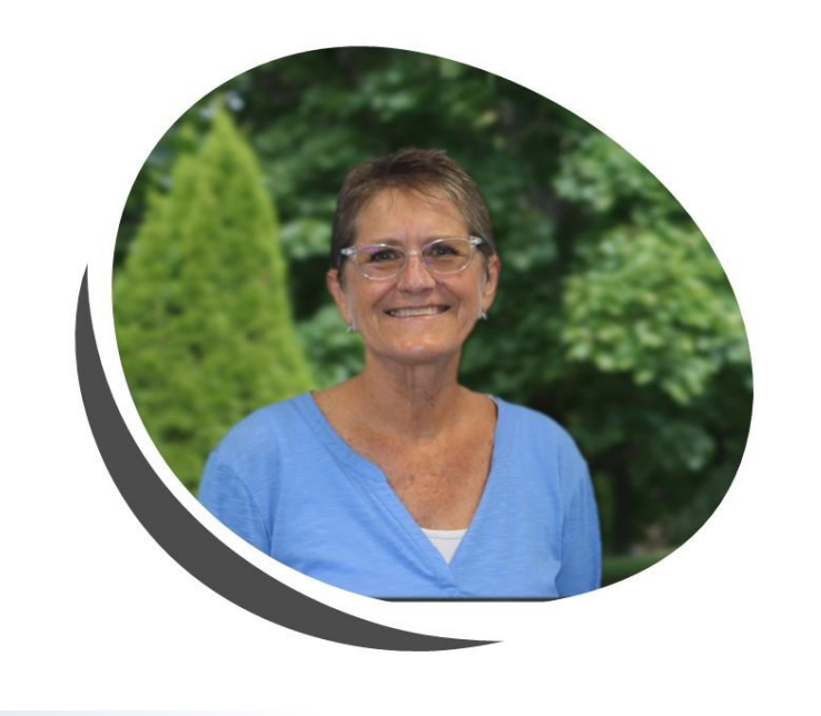
YOUR MUNICPAL COORDINATORS